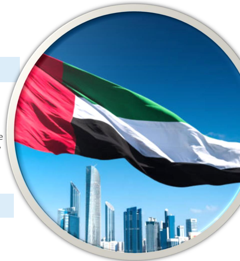
United Arab Emirates flag with towers skyline

The UN Convention says that persons with disabilities have the same rights as everyone else. It also tells how countries can protect these rights.