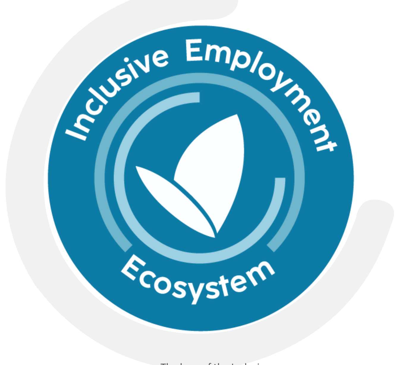
The logo of the Inclusive Employment Ecosystem