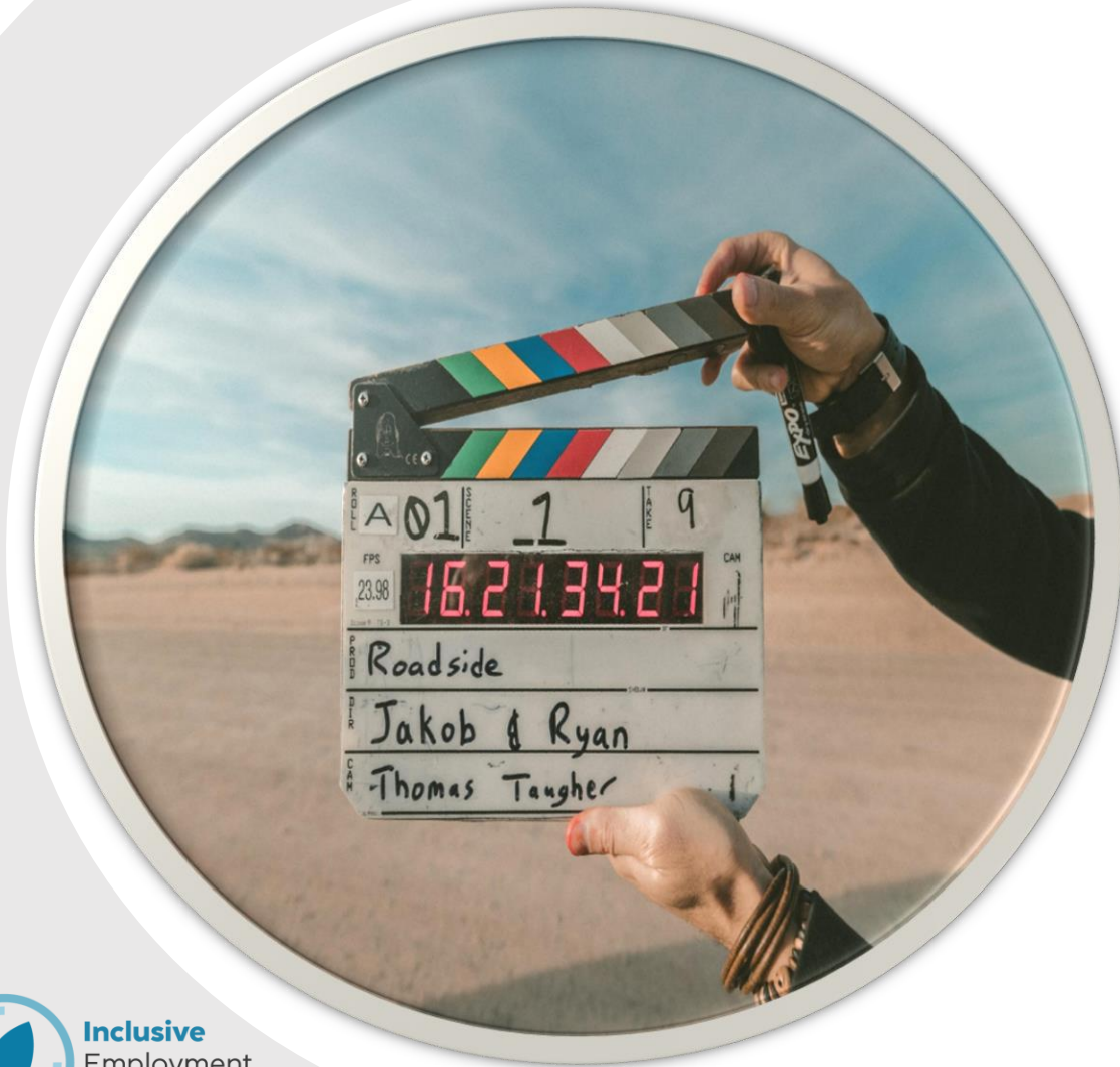
Hands holding movie clapperboard