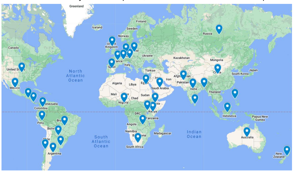
Figure II: World map indicating countries with National Business and Disability Networks

The next questions asked NBDNs about what they perceive as the most relevant opportunities for SMEs to promote disability inclusion, comparison to bigger companies and branches of multinational enterprises, and if there are currently any and/or initiatives stakeholders working on