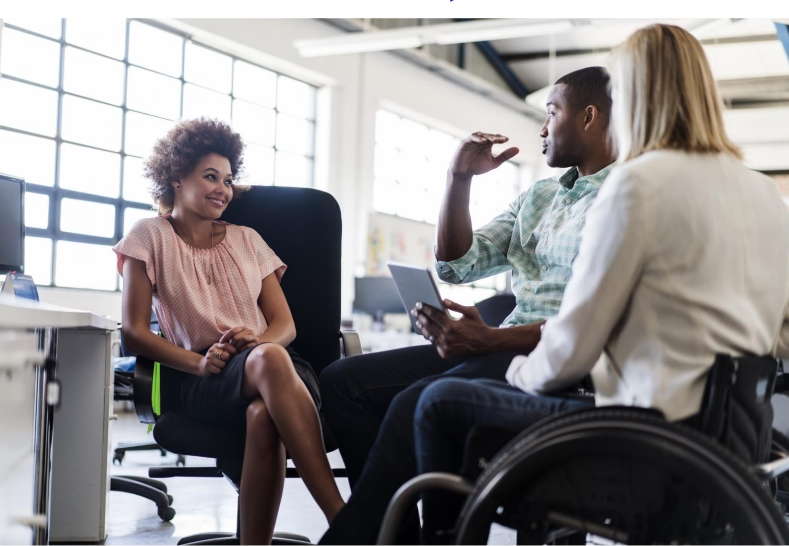
Analysis of a survey among National Business and Disability Networks