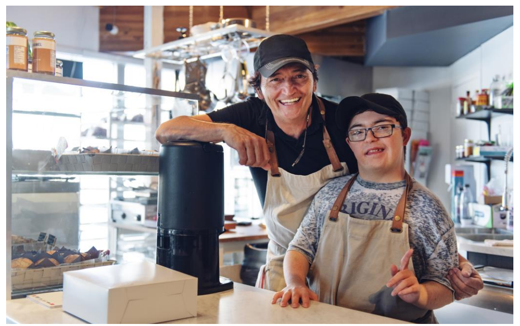
Figure I: Two smiling colleagues working at a café

Although SMEs can be a key player when it comes to providing job opportunities to persons with disabilities, there is relatively little research on the role SMEs actually have in employing persons with disabilities.