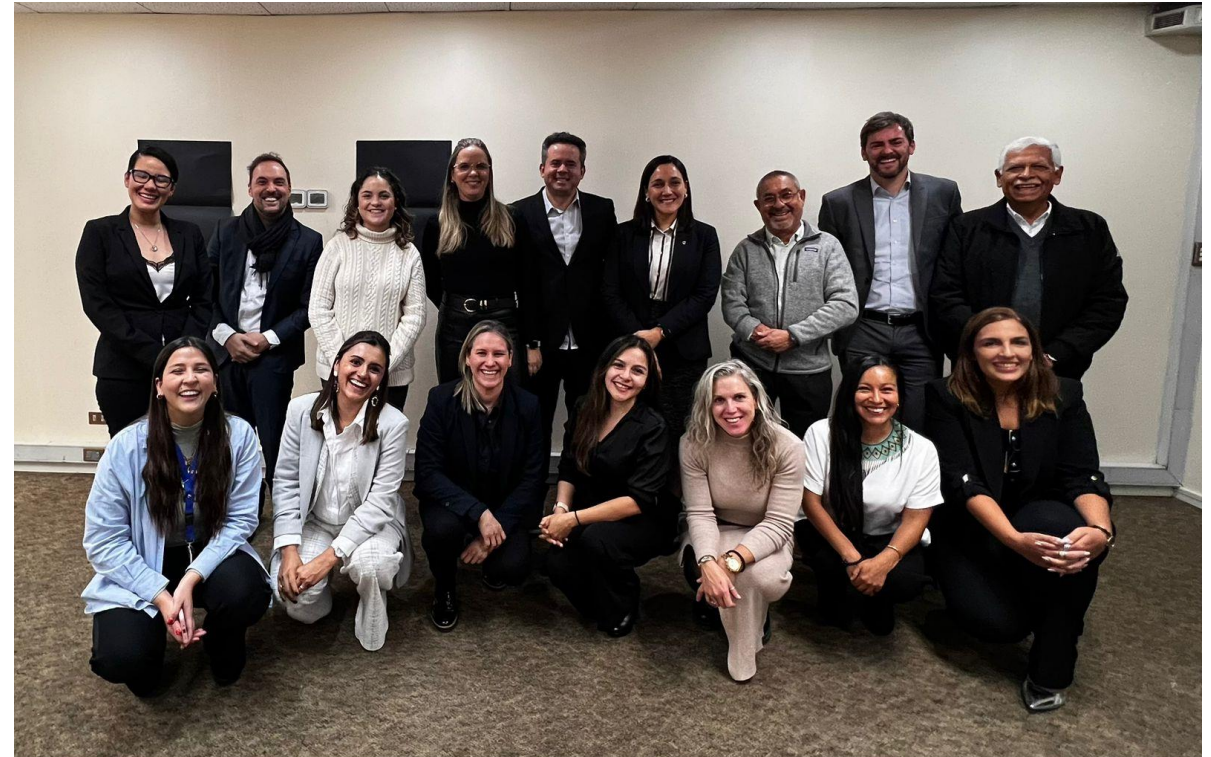
Representatives of Latin American National Business and Disability Networks, in Santiago de Chile on 8 May