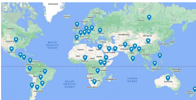
National Business and Disability Networks that are members of the ILO Global Business and Disability Network

The collaboration between UNGC and the ILO GBDN spans over a decade and started with a joint webinar on "Web Accessibility: The Benefits for Business" in early 2013.